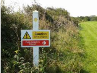
Cross the golf course towards the trees