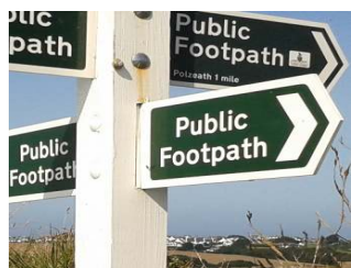
Follow the footpath signposted Polzeath