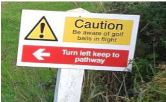
Turn left alongside the hedgerow