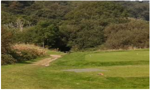
Go past the 17 th hole into the trees ahead