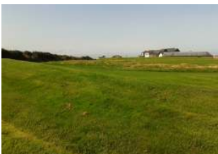
Continue past The Point Golf Club