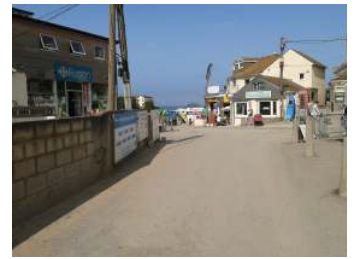
Cross the small brook, go past Shilla Mill, follow this track all the way to Polzeath Beach